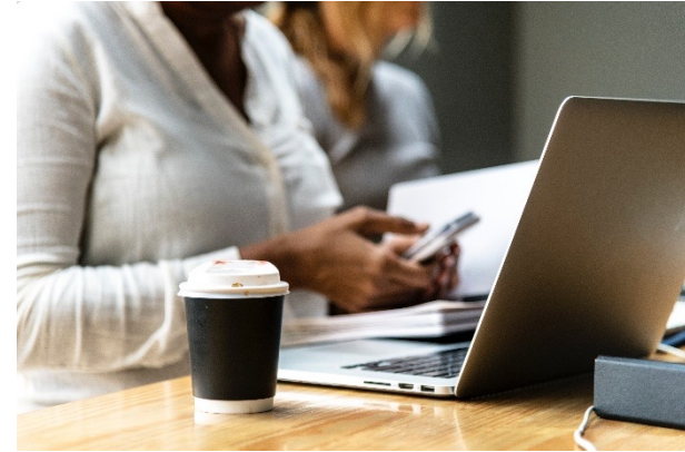
Employee's Issues Outside of Work